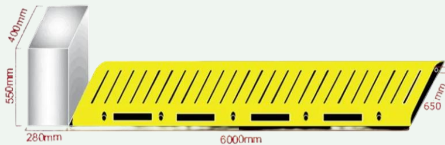
6 Meters Tyne killer drawing